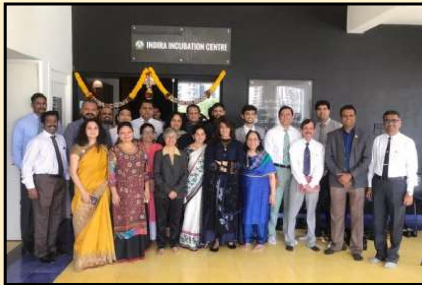
Indira Incubation Centre

The incubation Cell (IC) addresses development of product/Services using upcoming technologies in the institute which is incubated by budding developers who are the students of ICCS. The head of Incubation Cell of the Institute appraises each incubation proposal and the business plan based on pre-defined criteria. All the funding for the projects in incubation center are taken care of by the management. The activities in the IC include product development, product innovations, software testing, simulation and prototyping, pilot experimentation, along with our major ongoing project of Virtual Reality.