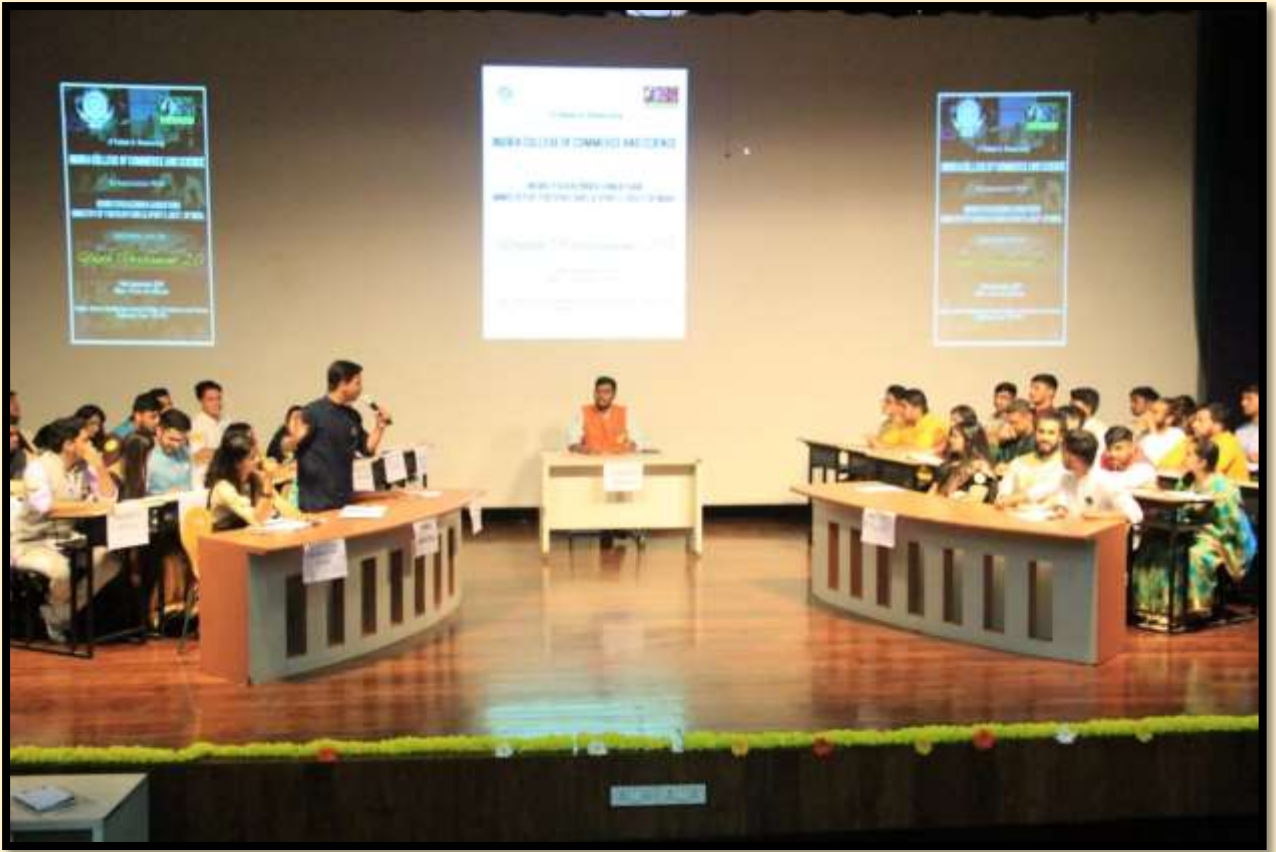
Glimpses of Youth Parliament 2019-2020