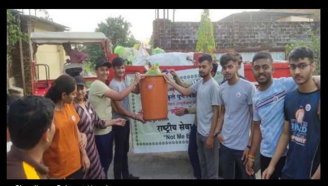
Cleanliness Drive at Morning