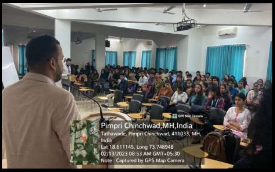
Ongoing guest Session

ICCS conducted a guest session on Global Immersion Program. The objective of the session was to give students an overview of the various global business models and make intercultural awareness among foreign study aspirants. 133 students attended the session and have showed interest to study abroad.