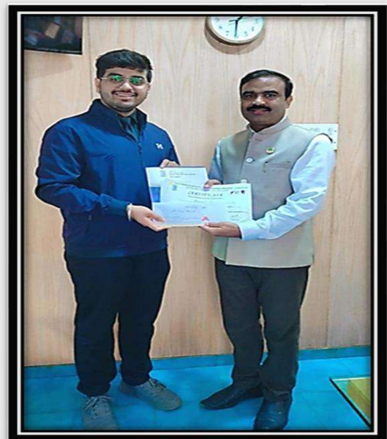
Awardee with Principal

The "Startup Sharks" competition is likely a prestigious event that showcases innovative ideas and projects, and to win the top prize is a significant recognition of his skills and abilities.