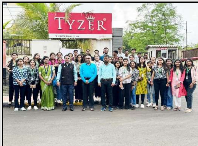
Students at Tyzer and Cotton King Pvt Ltd

The industrial visit to Cotton King Pvt Ltd in Baramati on 28 th Aug 24, was attended by 40 students and provided an invaluable hands-on experience in shirt making. Students gained hands-on experience in shirt making with advanced machines at Cotton King, learning about fabric cutting, stitching, and finishing. The facility prioritizes quality control and sustainability, using solar power and 100% water recycling. Students likely gained insights into quality control, technology's impact on efficiency and sustainability, and skills in operating machinery and teamwork. Cotton King aims to promote STEM education, inspire interest in manufacturing and technology, and develop sustainable practices.