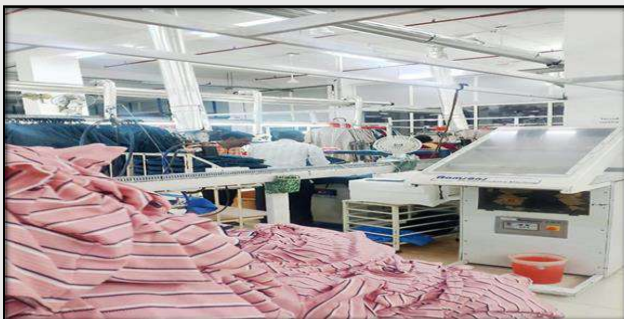
Manufacturing Process in Cotton King Pvt Ltd, Baramati

The industrial visit to Cotton King Pvt Ltd in Baramati on 28 th Aug 24, was attended by 40 students and provided an invaluable hands-on experience in shirt making. Students gained hands-on experience in shirt making with advanced machines at Cotton King, learning about fabric cutting, stitching, and finishing. The facility prioritizes quality control and sustainability, using solar power and 100% water recycling. Students likely gained insights into quality control, technology's impact on efficiency and sustainability, and skills in operating machinery and teamwork. Cotton King aims to promote STEM education, inspire interest in manufacturing and technology, and develop sustainable practices.