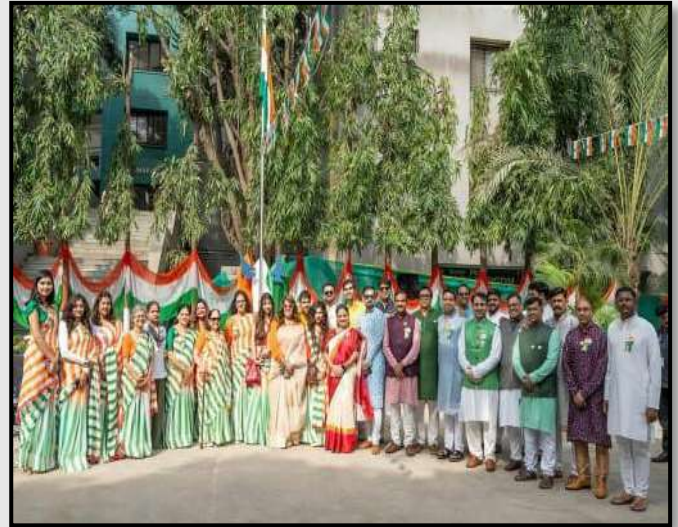
Flag Hosting Ceremony @ IGI

Indira Group of Institutes in association with Student's Council, Celebrated 78 th Independence Day on 15 th Aug. 24 . This day marks not just our freedom, but the unwavering commitment of our youth and women toward building a "Vikshit Bharat". With hearts filled with pride and hope, we honour the sacrifice of those who fought for this day and pledge to carry forward their legacy.