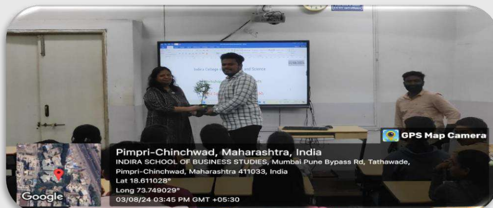
Felicitation of Guest

As a result, participants gained greater confidence and self-assurance, with many receiving valuable guidance toward achieving their career goals.