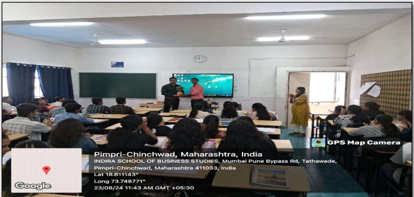
Felicitation of Guest