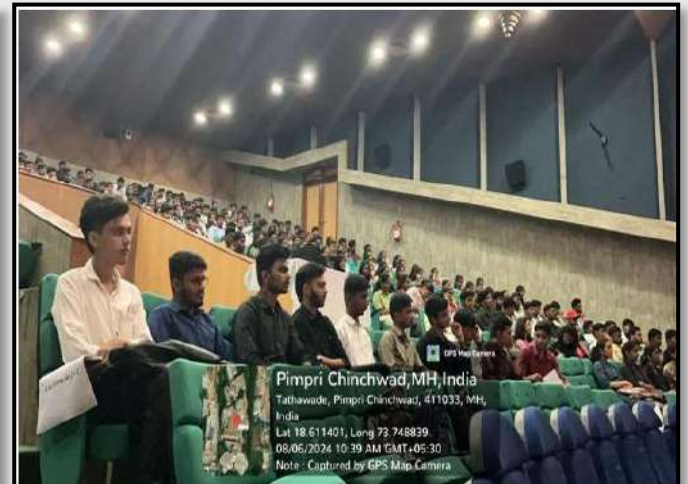
First Year IT Students attending Induction in Dhruv Auditorium.