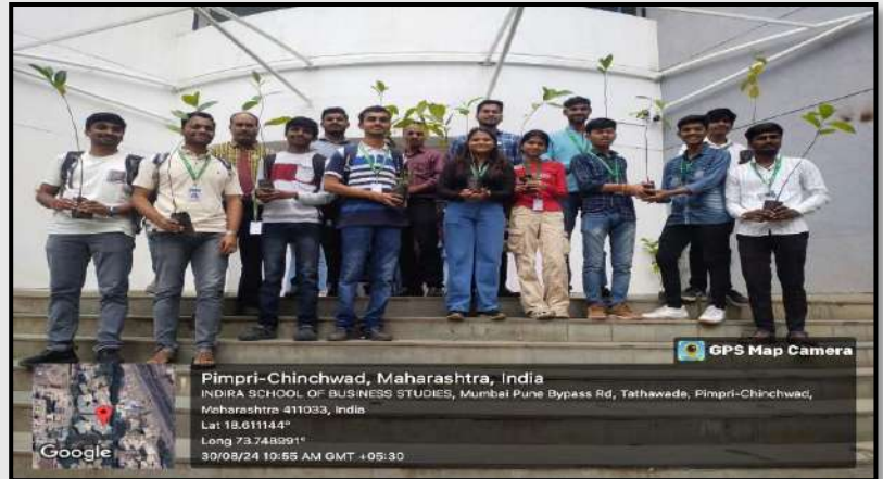
During Distributed of the saplings

This mission will be helpful to restore Indian environment up-to certain extent.