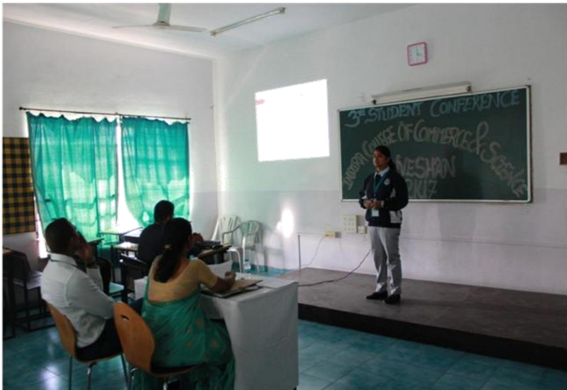
The paper presentation sessions evaluated by session chairs