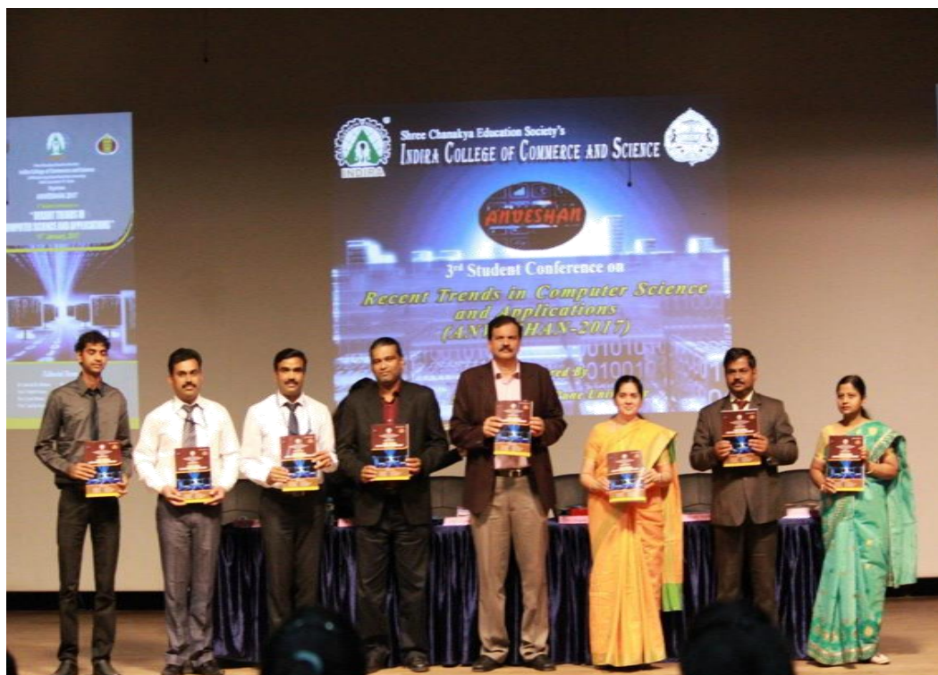
The release of Conference Proceeding